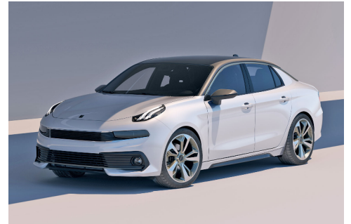
LYNK& CO 03 FOUR-DOOR SEDAN