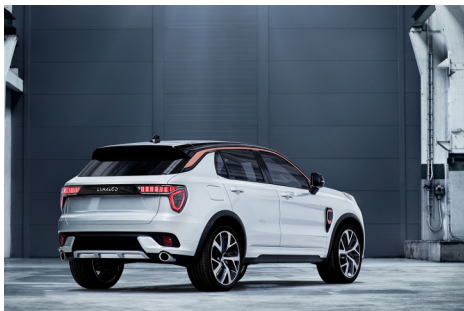
LYNK& CO 01 4WD SUV